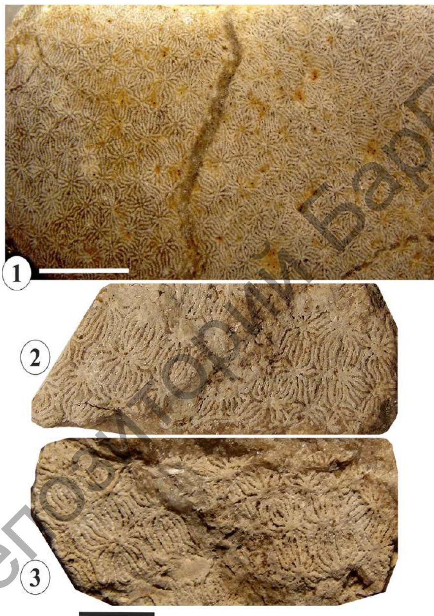
Figure 2. — Thamnasteria concinna (Goldfuss): polished cross section of part of the colony (1) and undamaged calicular surfaces (2, 3). Ledniki-1 sand and gravel pit near the town of Fanipal, Minsk Region, Belarus. Scale bars: 5 mm (1) and 3 mm (2, 3).