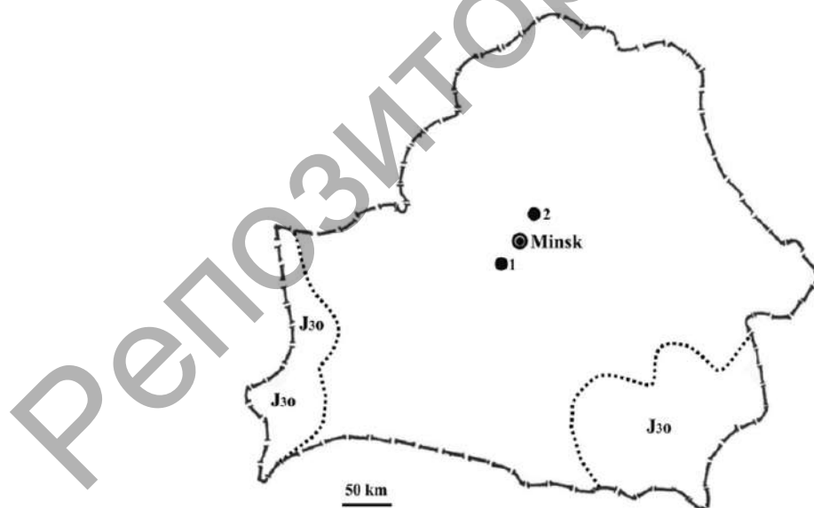
Figure 1. — Locality of material: 1 — Ledniki-1 sand and gravel pit; 2 — unknown locality in Lagoysk district. Dotted lines mark approximate limits of buried Oxfordian marine deposits (J 30 ) in the west and in the east of Belarus [2]

Another specimen has been collected by Dr. Dmitry Stepanenko (Belarusian State Technical University) from a road embankment near the city of Lagoysk, which is 40 km to the north-north-east of Minsk (figure 1) and is likely to have come from any of a number of neighboring sand pits that expose the upper Middle Pleistocene Sozh Formation. This area is confined closer to the northern part of the Minsk Upland. The collected specimen is a fragment of a lamellar colony 2.5 by 3.5 cm wide and 1.0 cm thick, with almost no traces of the source rock.