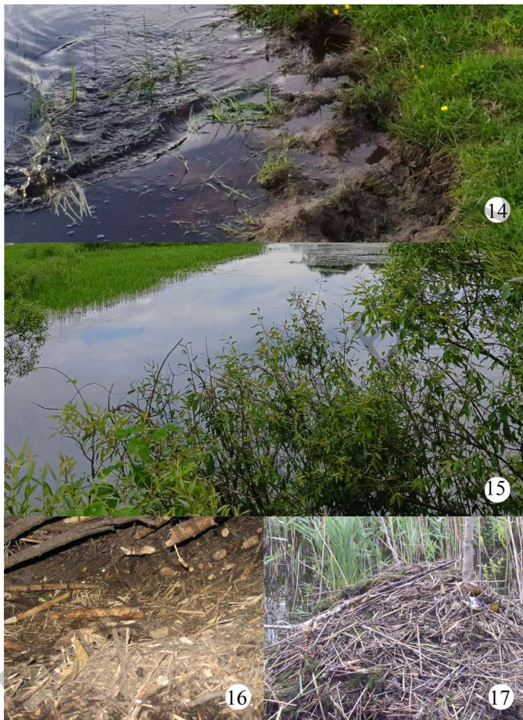
Figures 14—17. — Habitats of Dicyrtocercyon ustulatus : 14 — Pond in village Domzheritsy (Vitebsk reg., Berezinsky reserve); 15 — river Yaselda north of the village Snin, (Brest reg., Pinsk distr.); 16 — the inside of a beaver's lodge near village Stolovichy (Brest reg., Baranavichy distr.); 17 — muskrat lodge near village Domashevichy (Brest reg., Baranavichy distr.)

Рисунки 14—17. — Места обитания Dicyrtocercyon ustulatus : 14 — пруд в д. Домжерицы (Витебская обл., Березинский заповедник); 15 — р. Ясельда, севернее д. Снин (Брестская обл., Пинский р-н); 16 — внутренняя часть бобровой хатки возле д. Столовичи (Брестская обл., Барановичский р-н); 17 — хатка ондатры возле д. Домашевичи (Брестская обл., Барановичский р-н)