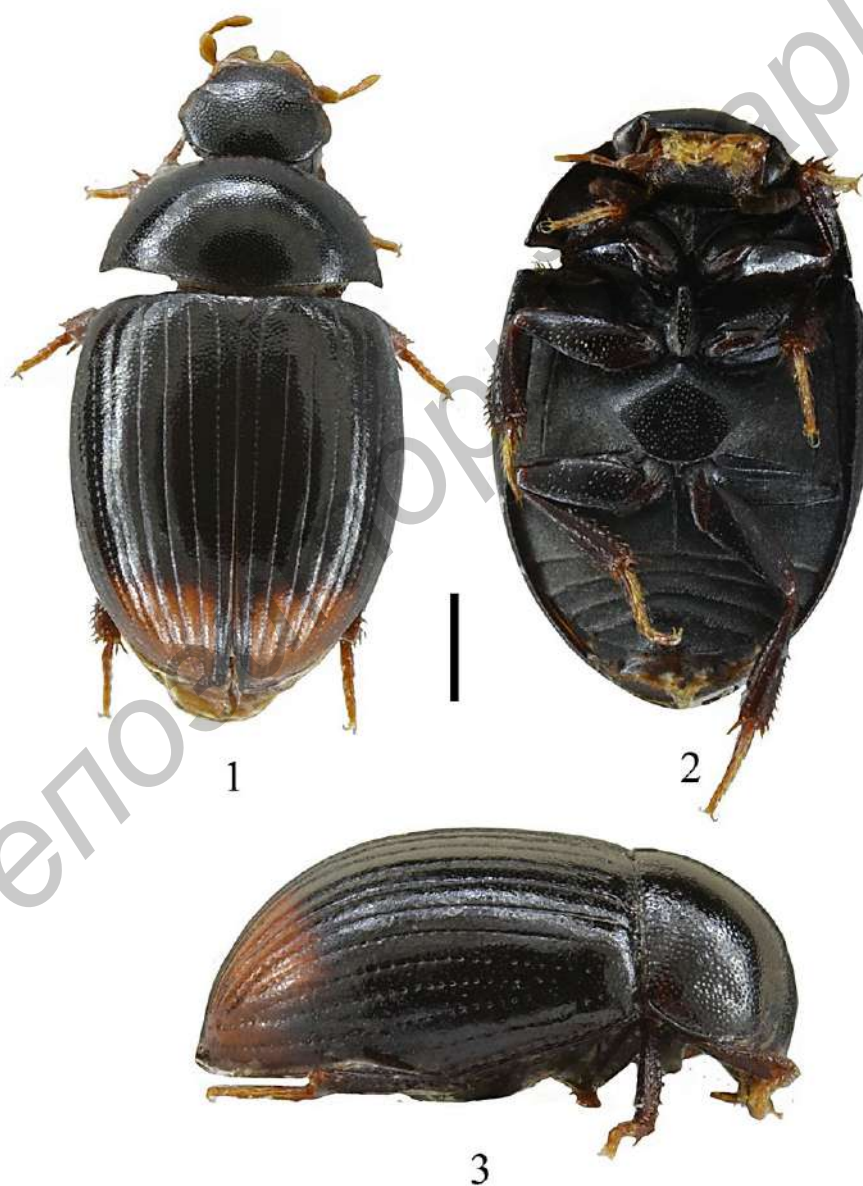
Figures 1—3. — Dicyrtocercyon ustulatus , habitus: 1 — dorsal view; 2 — ventral view; 3 — lateral view. Scale bar — 0.5 mm

Diagnosis. Body broadly oval, not parallel-sided at mid-length (Figures 1, 2). Dorsum without microsculpture. Lateral view of pronotum not forming a continuous curve with elytra, pronotum strongly bulging (Figure 3).